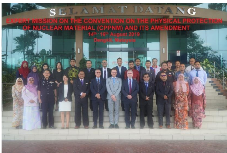
EXPERT MISSION, MALAYSIA, AUGUST