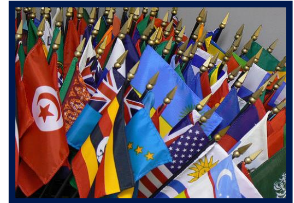
Strengthened Int'l Co-op.