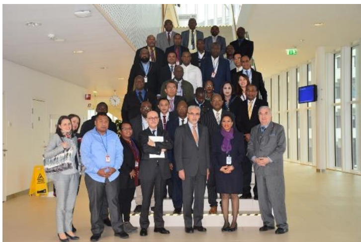
INTERNATIONAL SEMINAR, VIENNA, MAY