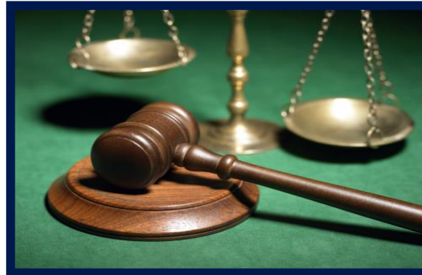
New and revised Criminalisation