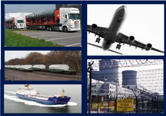
Extended Physical Protection