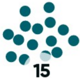
Graded approach to medical applications